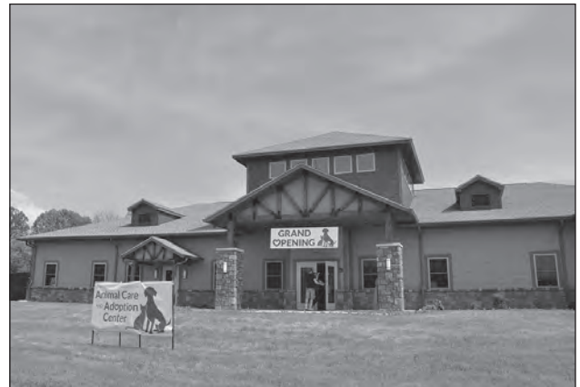
Montgomery County Animal Care and Adoption Center